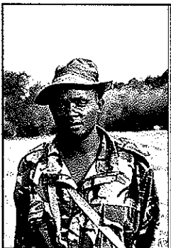
Kenyan Police Officer in the Maasai Mara on patrol for poachers.

Two months ago, someone tried to bribe two police officers and they arrested him. And they were promoted. It was such a big deal that it made the newspapers. So, progress is happening for the Kenyan Police.